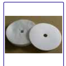
SPARKLER FILTER PADS