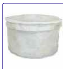
NUTSCHE FILTER BAG