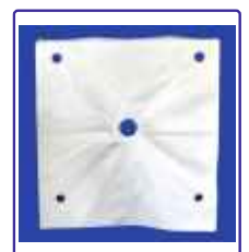
BUTTERFLY FILTER CLOTHES