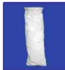
JET MILL BAG