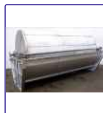
ROTARY VACUUM DRUM FILTER BAG