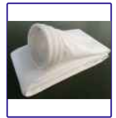
DUST COLLECTOR BAGS