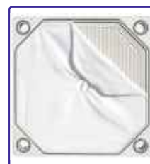
CGR FILTER PRESS CLOTH